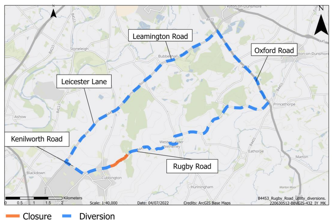
Map 2: Road Closure and Diversion